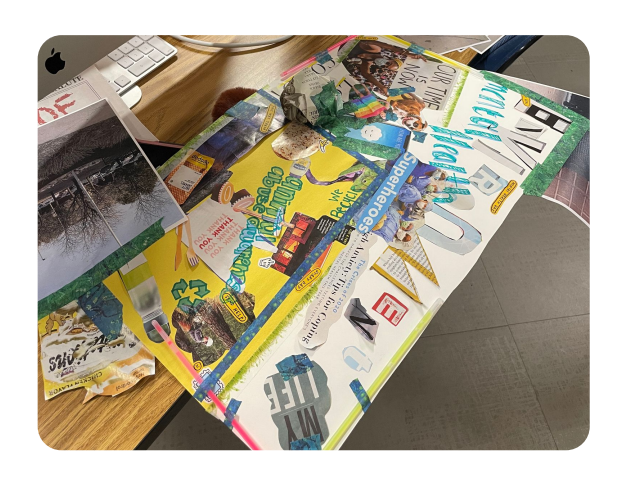
SELF & VULNERABILITY